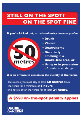
Still on the spot? On the spot fine (PDF, 102KB)

Venues are also required to inform patrons of their requirements under the Fail to Quit laws: