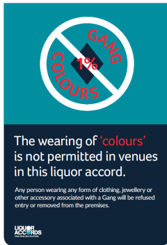
No gang colours (PDF, 49KB)

Venues are also required to inform patrons of their requirements under the Fail to Quit laws: