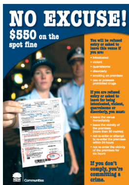
No Excuse! $550 on the spot fine (PDF, 248KB)

View the Special licence conditions for premises in Kings Cross Fact sheet (PDF, 1.73MB)